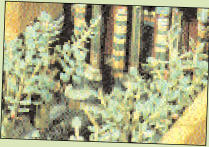
Where is this garden blooming?

2. Find this work in the Lila Acheson Wallace Galleries of Egyptian Art on the first floor. HINT: Take the corridor to the right of The Tomb of Perneb. Make a right and enter the first doorway you see.